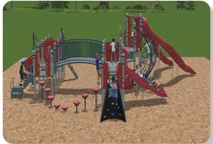
New playground equipment for Brookline Park coming in the Fall.

The next phase of the project will include parking improvements along Sagamore, new sidewalks along Earlington and Sagamore, perimeter fencing and tree planting. This work will begin in early 2026. The Brookline Park master plan can be viewed on the Township website at www.havtwp.org .